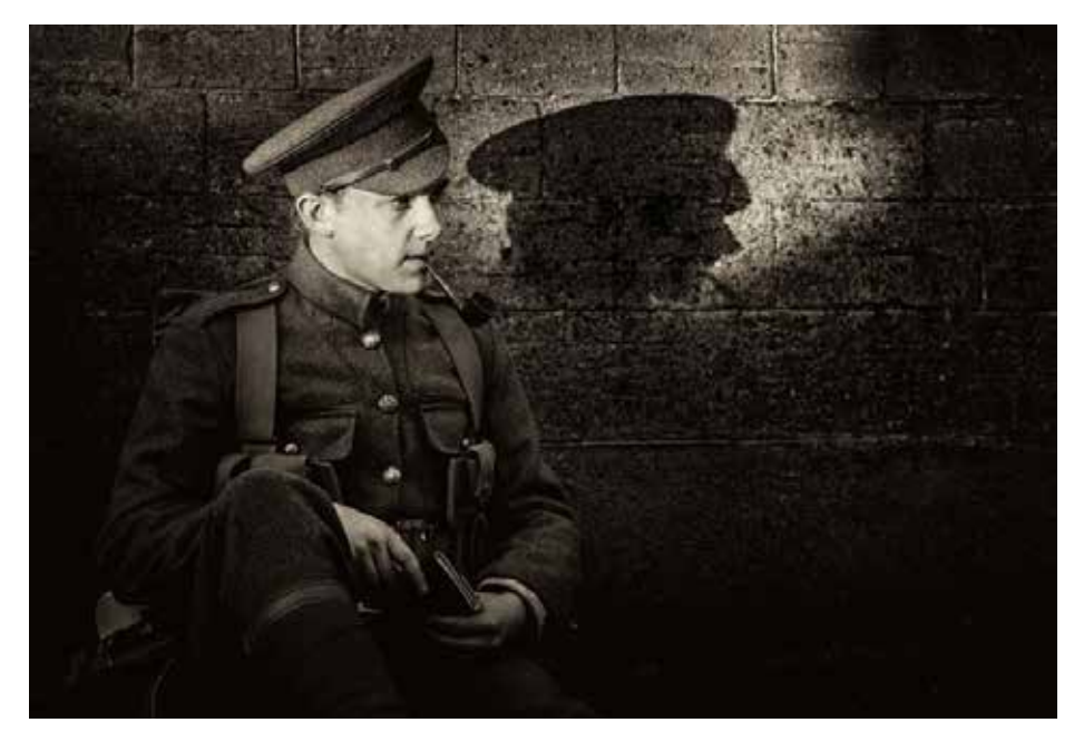
The dying of the light by Gareth Morgan