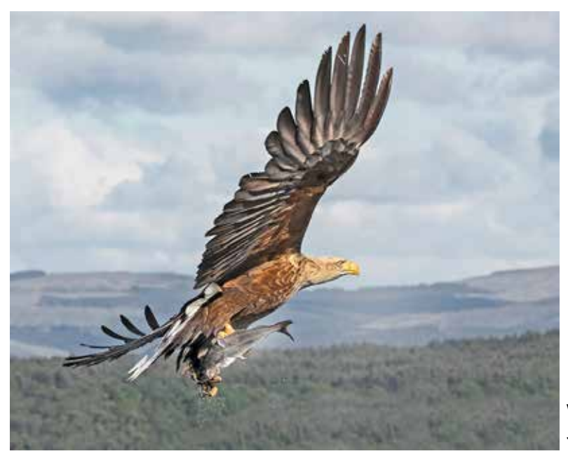
White Tailed Sea Eagle